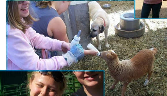
Bottle feeding lambkins & "running" goats to pasture.

guinea pigs to hug, then played charades 'til bedtime! Our windy mountaintop first night was coooool sleeping in our tent. Our sleep was interrupted by 4:30am rooster 'alarm'. Eventually we admitted morning, packed up and all chipped in to make our own farm yummy breakfast!