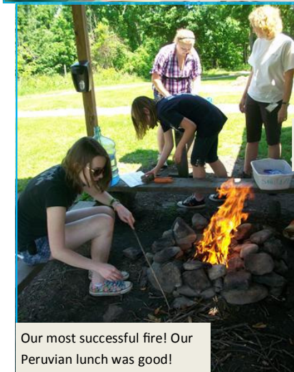
Our most successful fire! Our Peruvian lunch was good!

We arrived at Heifer International's Outlook Farm in MA just in time for a veggie pasta supper, farm raised meatballs, fresh garden variety salad, garlic bread, and beet cake! Skeptical, students soon learned how tasty farm cooking really is! While touring the grounds. We found sweet