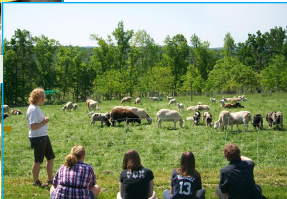
(up) Mt. top Outlook Farm is a summer stunner(Dwn) world market bargainer!