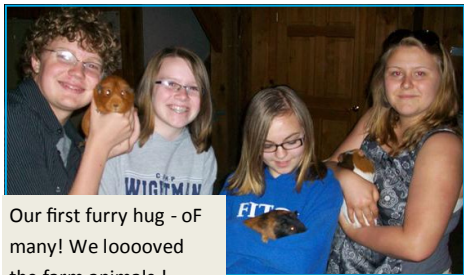
Our first furry hug - of many! We looooved the farm animals!

Co-Op Youth Sunday was during a very busy time of year. Four stalwarts not required elsewhere were able to present a version of The Lord's Prayer, sign "Testify to Love", & present youth-created slideshow of our winter retreat themed "Finding Rest in our Rest-Less World" to PBBC. Here's Heifer!!!