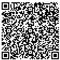
Friday at NBC

The concert Sound of Four on April 20 was a great success and the musicians will be back, this time with their mentors in the American String Quartet.