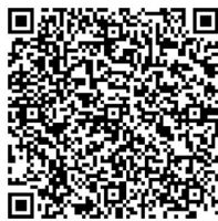
Saturday at UBC

Tickets are for sale through their website, www.mysticchambermusicseries.com .