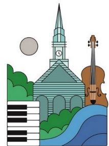
Mystic Chamber Music Series